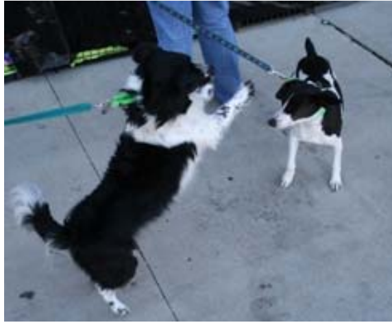
MARY PICKFORD AND WALTER MATTHAU