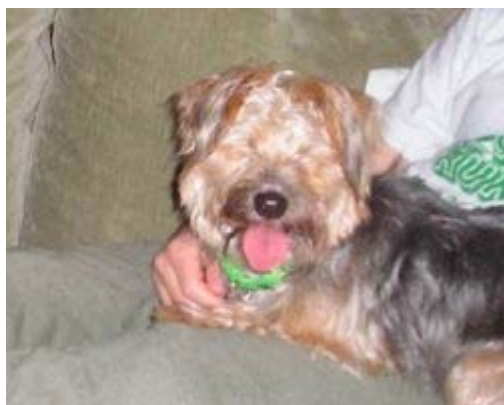
ROYSTON (NOW RUDY)