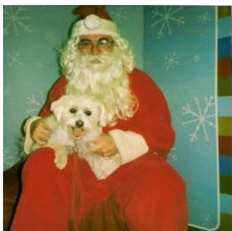
VANILLA BEAN, "BEANY"