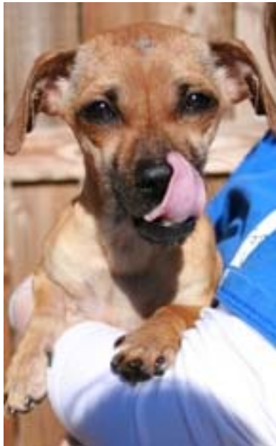
CINDY LOU WHO