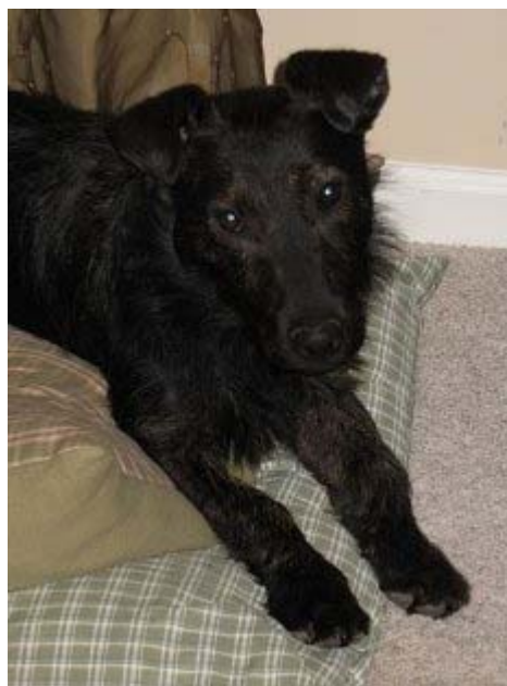
DECATUR (NOW ZOE)