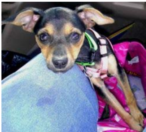
Baily (fka Barbarella)