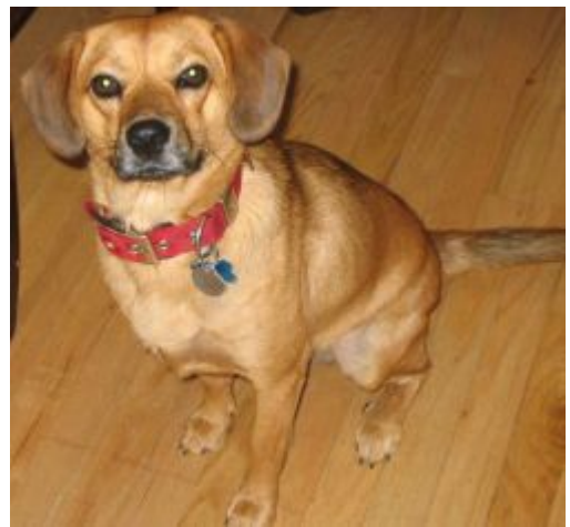
Tilly (fka Satilla)