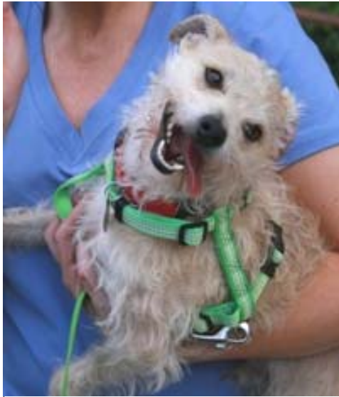
Lords a Leapin’