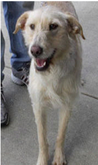
"Goat" – SDR Alumnus

In the meantime, Lady kept herself busy, cheerfully chewing up the family's laundry, cable line, Barbie dolls and oriental rugs. She showed off her agility by leaping up onto the dining room table to retrieve a placemat. And for almost 10 months, she presented herself at SmallDog Rescue's Saturday adoptions, putting her best foot forward, with Alexander there to act as her champion. Sure, people showed interest in Lady, lured in by her visible charm and gregarious personality, but given few minutes of interaction, her abundant energy wore them out and they moved on to look for a different dog to take home.